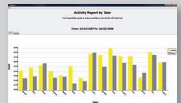
Export as PDF or Excel (CSV)