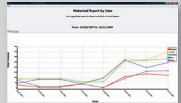
Generate Graphical reports